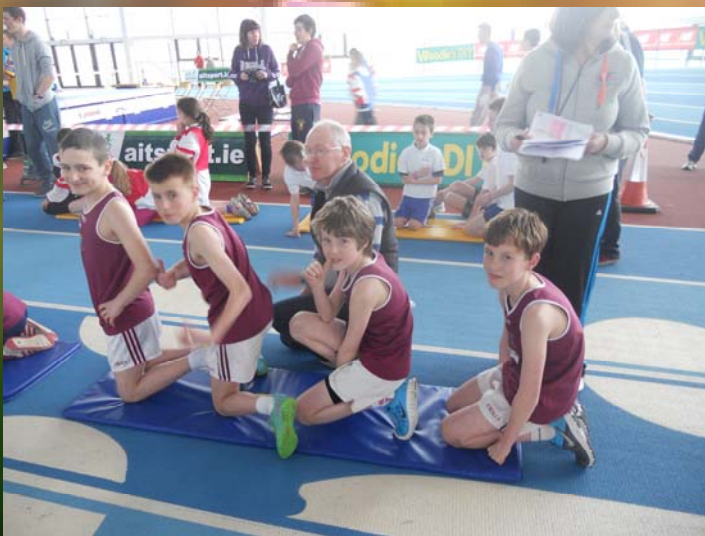
Our Sports Hall athletes waiting for the next event in Athlone.