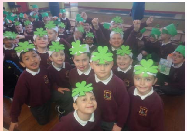
Boys from first and second class enjoy the show!