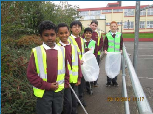
Green School Committee looking after the litter