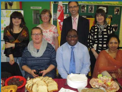
International food tasting