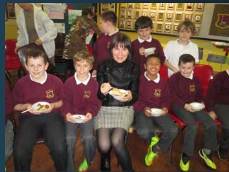
Ms. Lagan and pupils sampling some tasty delights from around