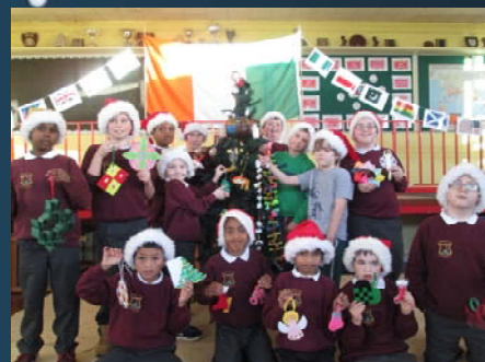
Hanging the decorations from the other European countries.