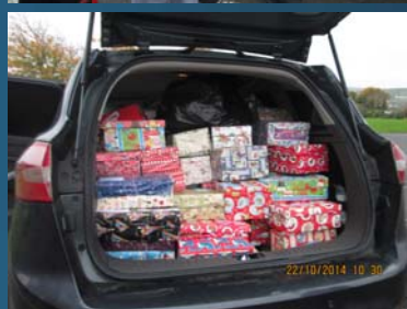
The pupils of Scoil Cholmcille filled shoe boxes with Christmas presents which have been shipped to Eastern Europe.