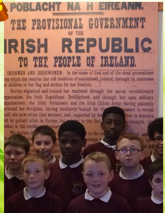
The boys are standing in front of the largest copy of the proclamation in Ireland