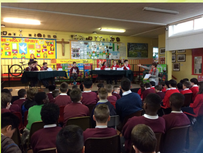
We welcomed Woodlands N.S. for a fantastic debate. We proposed the motion that "video games have no benefit"