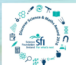
Congratulations to all the boys in Scoil Cholmcille who have won the Award of Science and Maths Excellence for their endeavours on the Discover Primary Science and Maths Programme for the second year in a row.