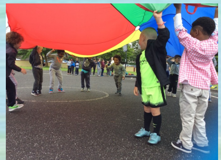
Fun with the parachute!