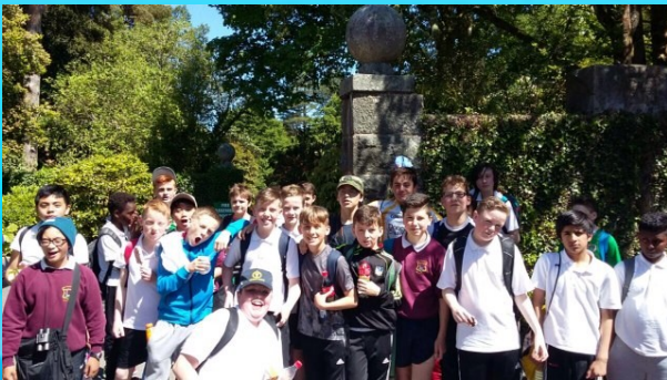
The 6th classes on their recent trip to Glenveagh.