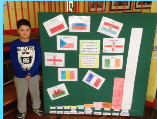
Mrs. Shields helped Omid to make a bar graph showing which countries boys are cheering for in the European finals in France!

A huge farewell to our 6th classes and we wish them every success in their new schools!