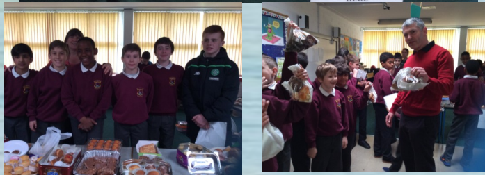
Delicious cakes and treats, and a lovely opportunity for a wee catch -up!