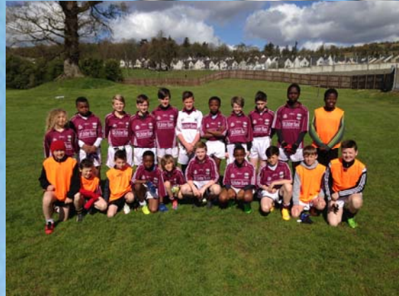
Cumann na mBunscoil County Champions 2015!