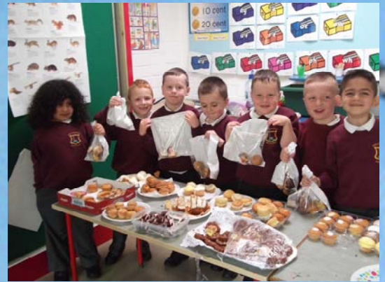
Check out the smiles on these boys' faces