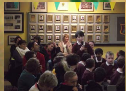
Some snapshots from the debates.