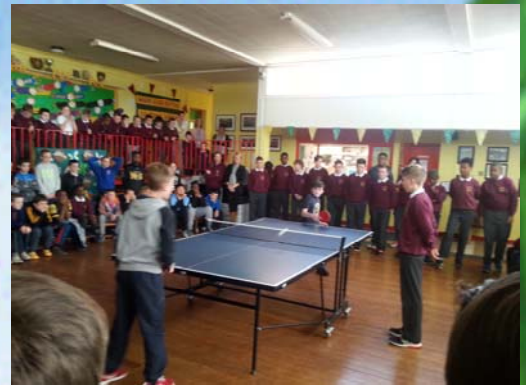
Some action from the table tennis tournament 2015