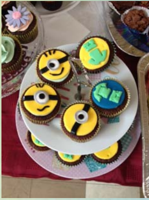
Some tasty treats from our annual cake sale