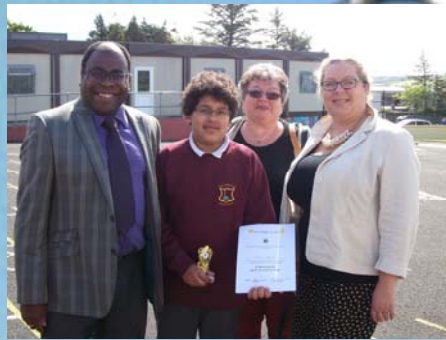
Family members celebrating the trophy win